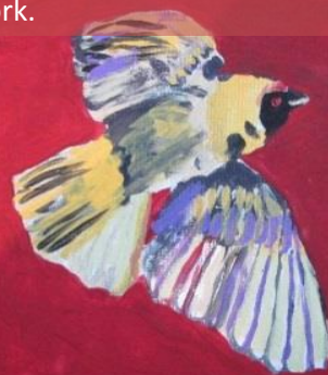
Artwork by: Jason Keey

Examples of Cottage Studio artists’ work.